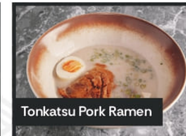
Tonkatsu Pork Ramen