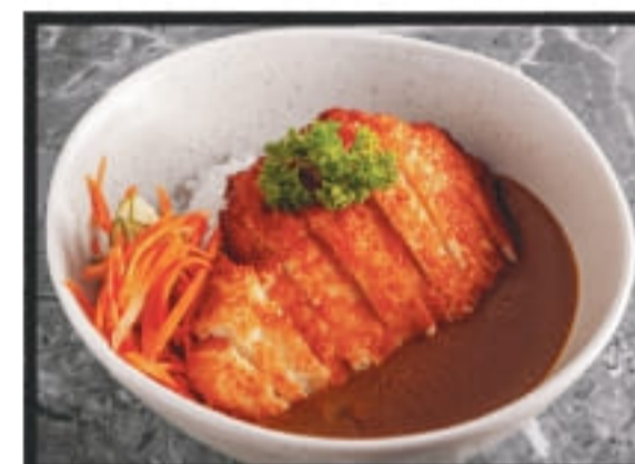
Tori Chicken Katsu Curry