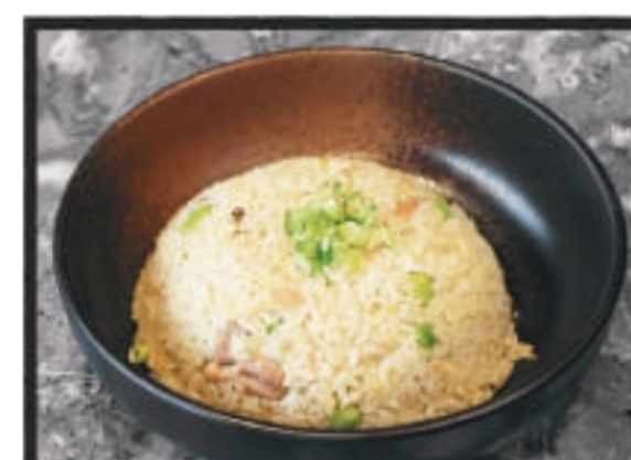
Tori Chicken Fried Rice