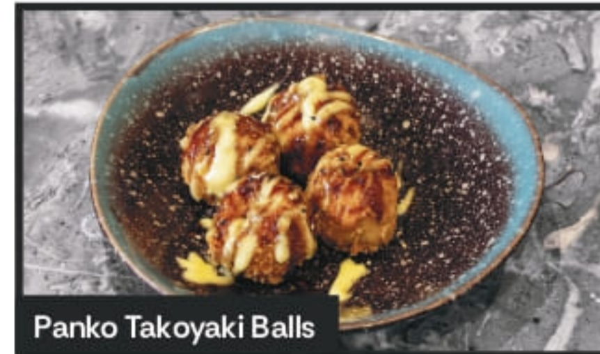
Panko Takoyaki Balls