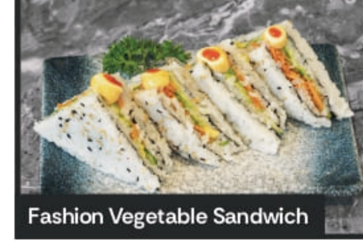
Fashion Vegetable Sandwich