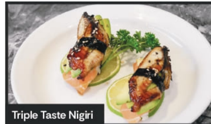
Triple Taste Nigiri