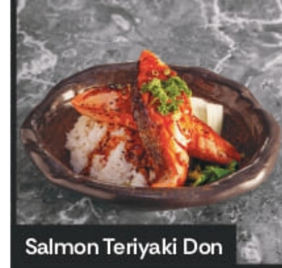
Salmon Teriyaki Don