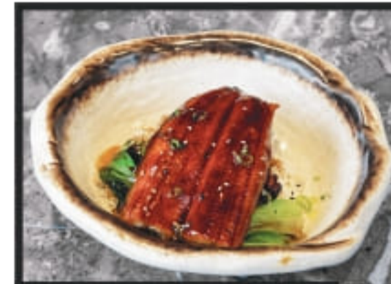
Grilled Unagi Eel Don