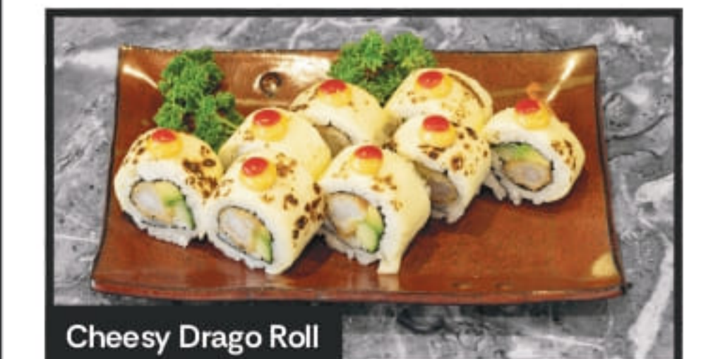
Cheesy Drago Roll

Salmon, avocado and cucumber inside, rolled with a crispy fried onion topping.