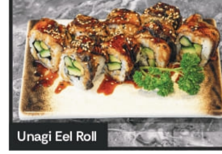
Unagi Eel Roll