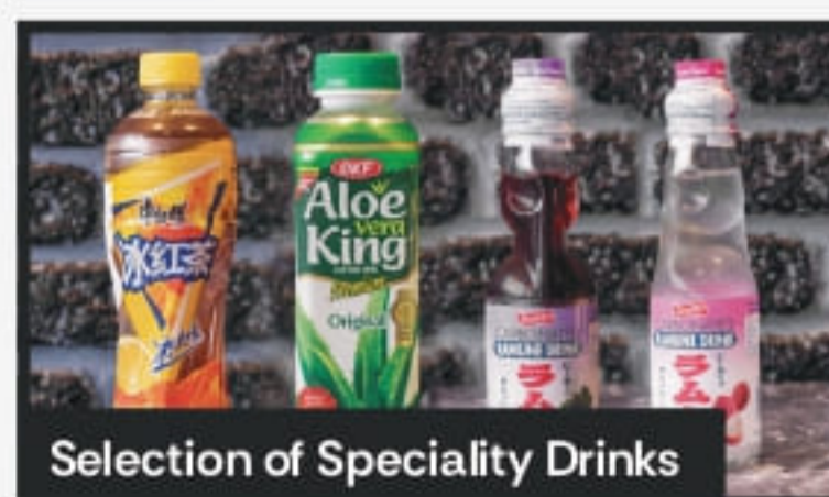
Selection of Speciality Drinks