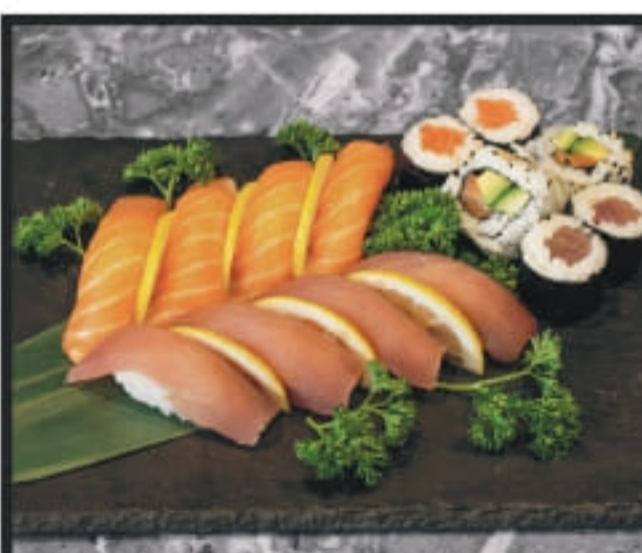
Sushi Combo 2

5pcs salmon sashimi, 8pcs cucumber maki, 3pcs prawn nigiri, 3pcs salmon nigiri, 3pcs tuna nigiri. £21.00