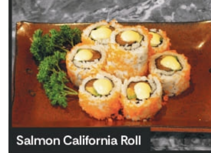
Salmon California Roll