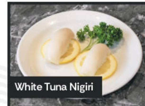
White Tuna Nigiri

Ramen noodles served with egg, naruto, nori, bamboo shoots, sweetcorn, sesame & spring onion, in freshly made pork broth.