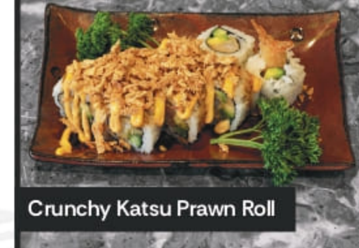
Crunchy Katsu Prawn Roll