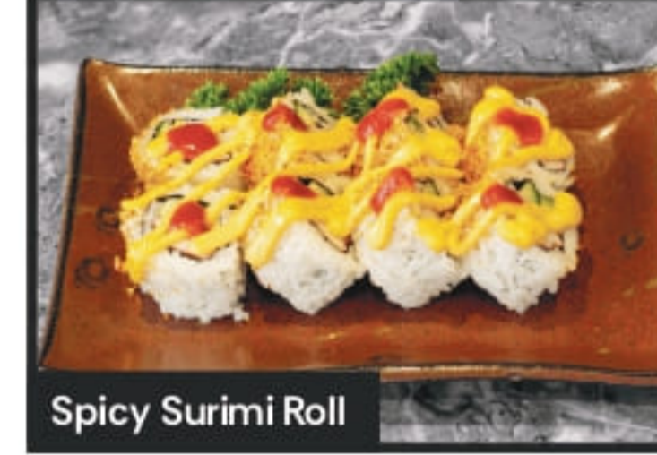
Spicy Surimi Roll