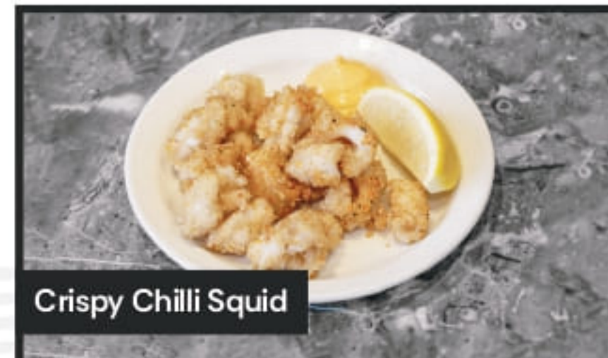
Crispy Chilli Squid