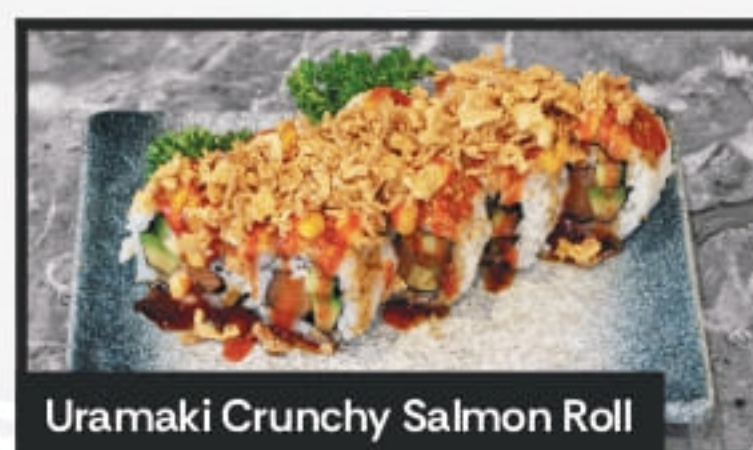
Uramaki Crunchy Salmon Roll