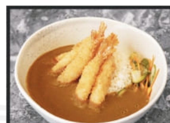
Prawn Katsu Curry